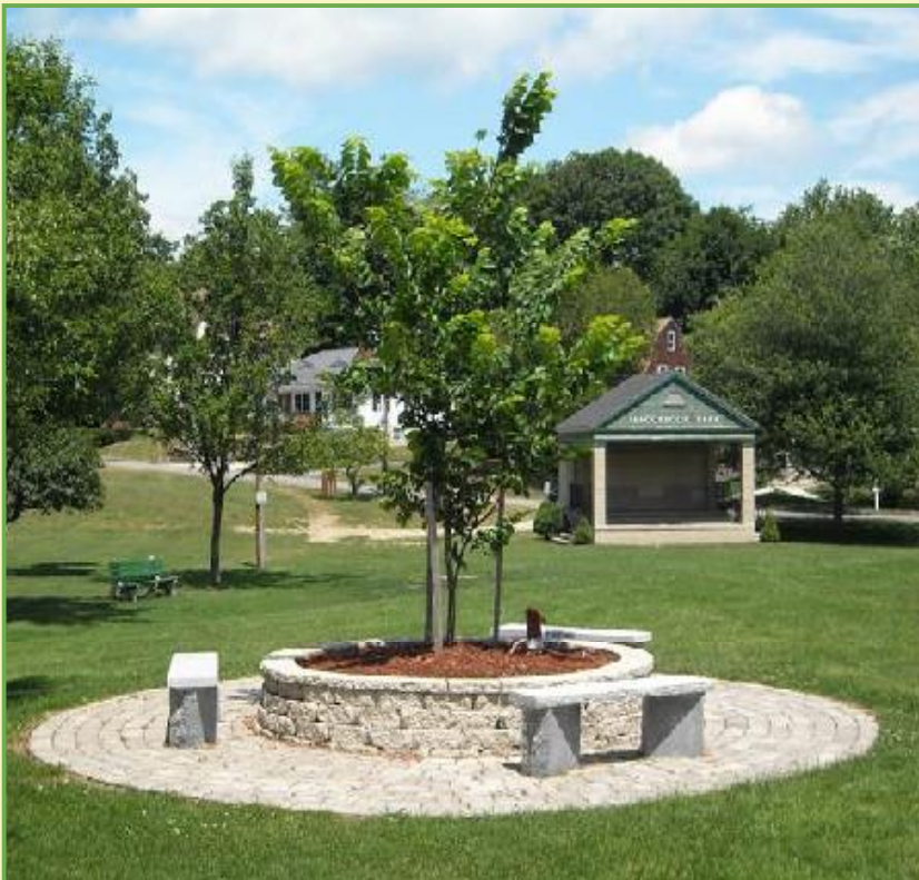
LIBERTY TREE MEMORIAL, DERRY NH

Ask about our custom messages and 6" x 10" donor plaque naming the sponsor of the Memorial.