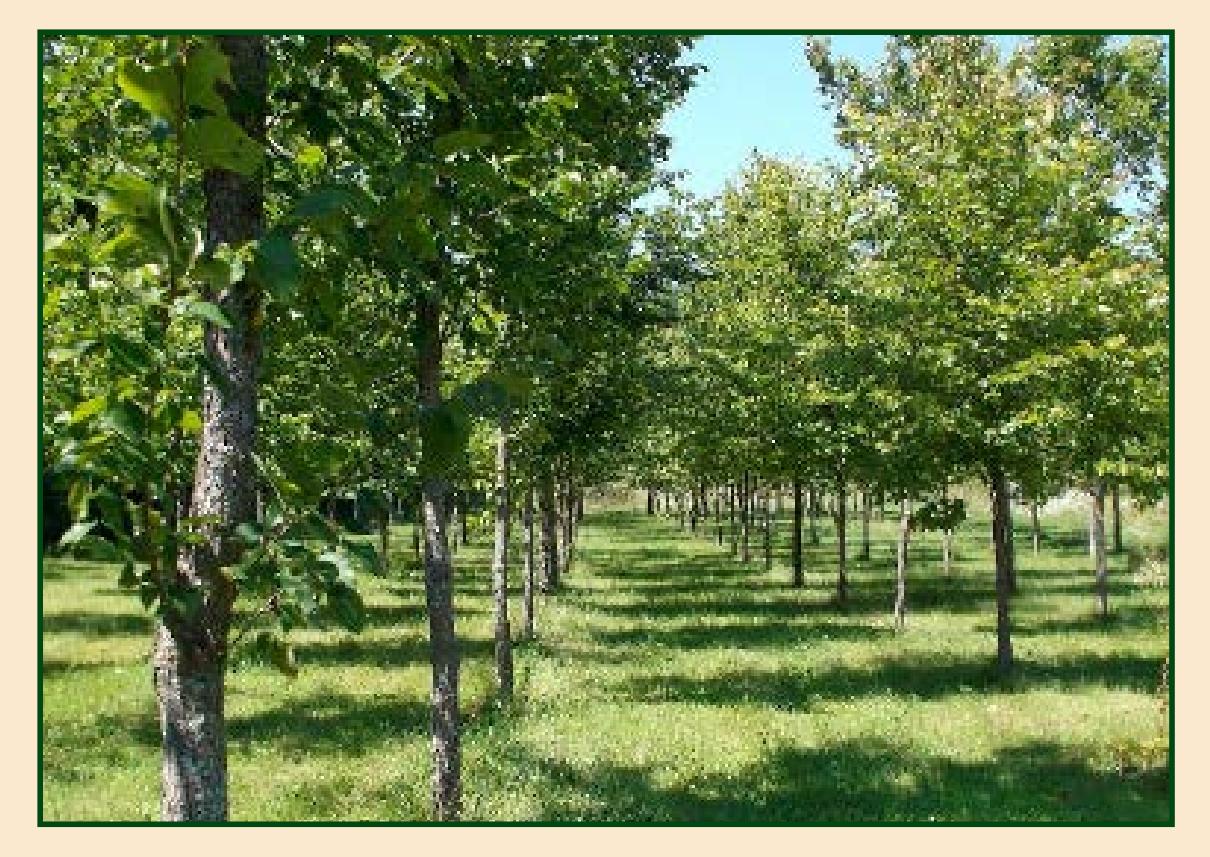
These 3"-5" caliper disease-resistant specimens of 'Ulmus americana libertas' are now available with cast bronze plaque for planting as Liberty Tree Memorials.

Call Yvonne at (603)209-2434 for pricing. FOB, Keene, NH