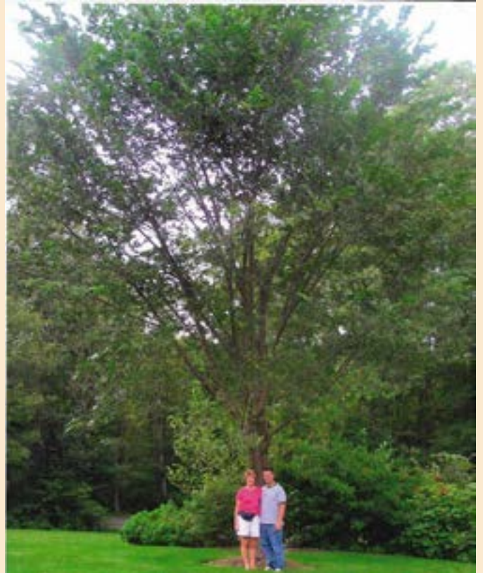
9 year old Liberty Elm - 35 ft. feet tall

2007 350,000 Liberty Elms planted at 5% confirmed losses to DED.