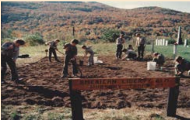
First Johnny Elmseed Nursery established by Troop 23, Bolton, VT

1984 Johnny Elmseed Nurseries program begins.