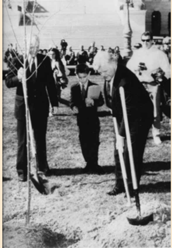
Senator Ted Kennedy plants Liberty Elm at U.S. Capitol Bldg, Washington, D. C. 1983

1993 Liberty Elm planted on the grounds of the U.S. Capitol .