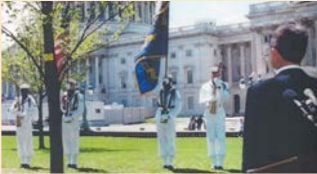
Liberty Elm planted by No Greater Love in honor of Senator John Kerrey (Neb.) U.S. Capitol Bldg, Washington, D. C. 1983

1999 Another Liberty Elm planted on U.S. Capitol grounds.