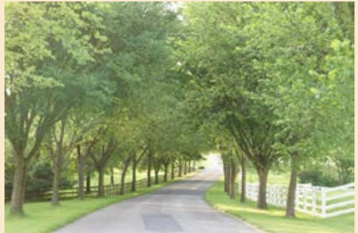
Picken's Allee , Glenelg, Maryland - 2019

2020 Survivors -Allee of (60) Liberty Elms (planted in 1994) over 50 feet tall.